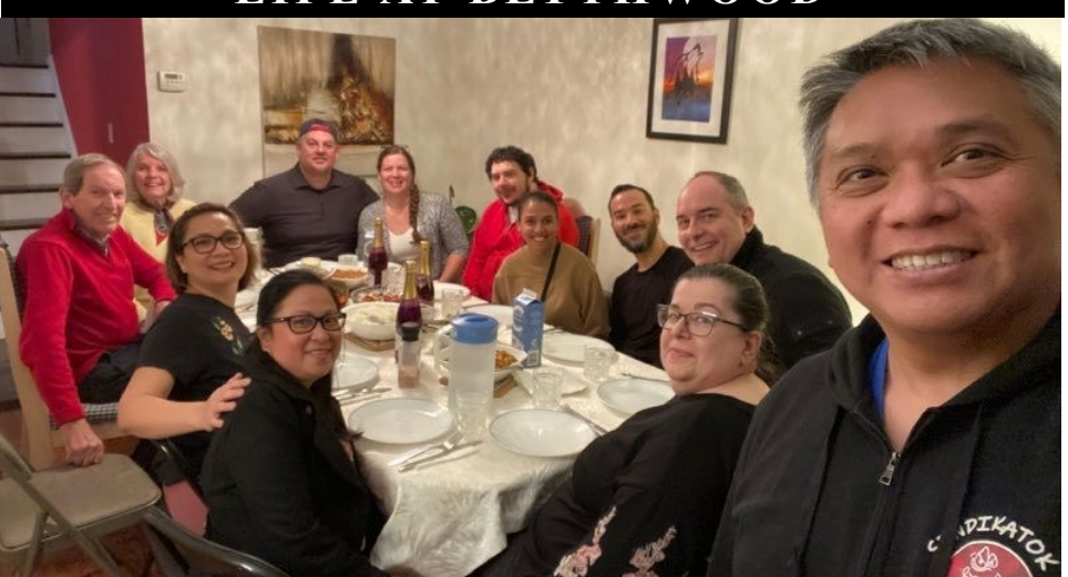
Thursday, November 23rd Bible Study